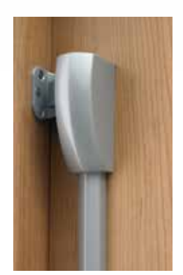
Upper Side Pullman