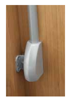
Lower Side Pullman