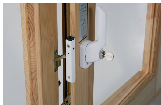
Turn mode limit