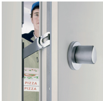
EntryGuard™ provides peace of mind for those home alone