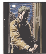
"Nice to see that they kept Entryguard active"