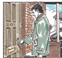
...Arriving home, no need to deactivate EntryGuard from the inside