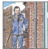
I think the empties must be at the back of the house