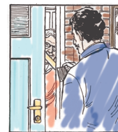
"Would you like to pay today madam"