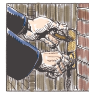
"I hope that no-one wakes - it's so late"