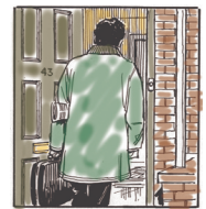
"Hi, I'm home!"