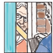
"Just a minute, I will open the door"...