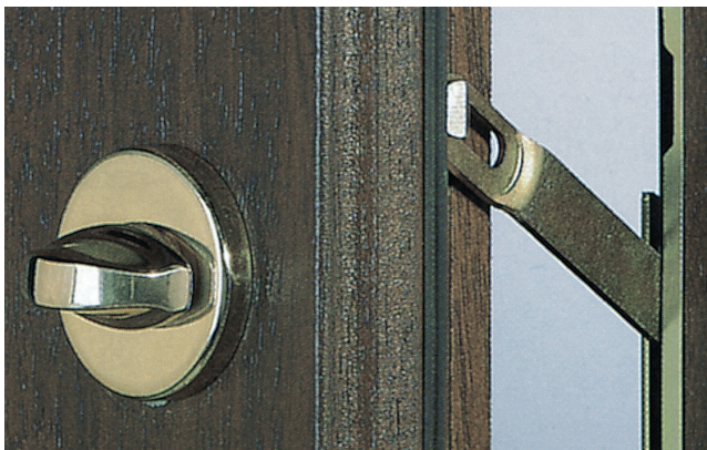
EntryGuard™ illustrated in the open position