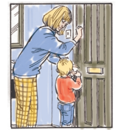
"You know you shouldn't try to go outside on your own!"