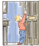
I wonder if I.....