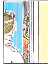
Who's this?.....It's only the nurse.