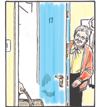
"Hello, nice to see you. Come to check up on me?"