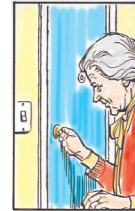
Better let her in. "A simple turn of the knob"