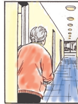
Looks very quiet - think I'd better lock up..