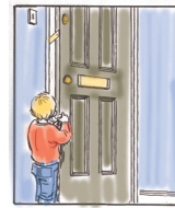
why can't I .....