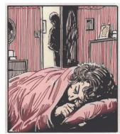
"As I thought no-one stirred"