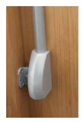
Lower Side Pullman