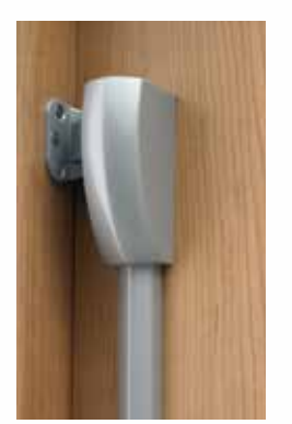
Upper Side Pullman